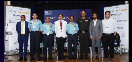
ISpA Space Track at Geointelligence 15 June 2022