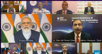
ISpA Launch Ceremony 11 October 2021