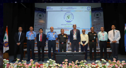
Indian DefSpace Symposium 11-13 April 2023