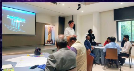
ISpA-Blue Origin Workshop 1 November 2022