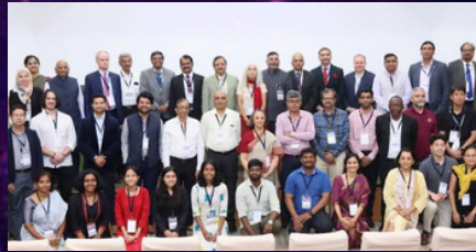
Space Technology Conclave 15-17 October 2022