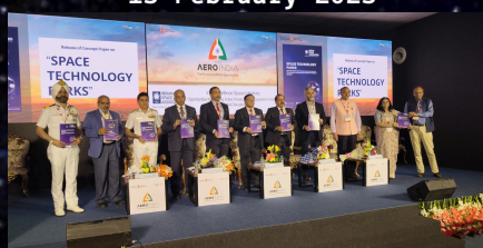
Seminar & STP Concept Paper Release at Aero India 13 February 2023