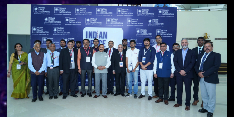
ISpA Indian Space Conclave 10-11 October 2022