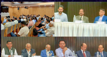
ISpA-ISRO Seminar for MSMEs 24 July 2022